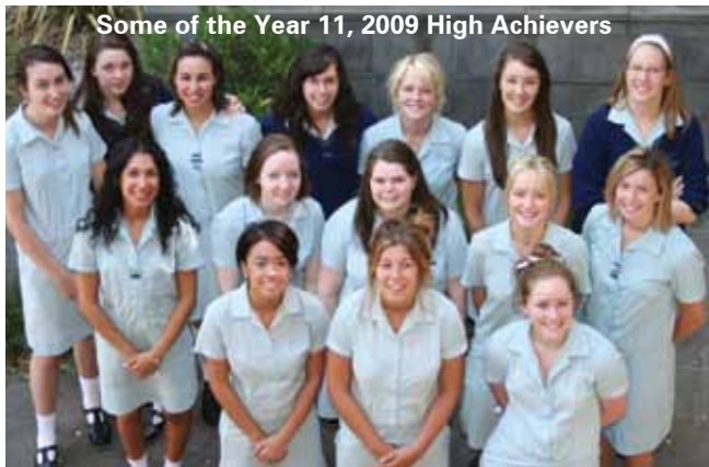
Some of the Year 11, 2009 High Achievers