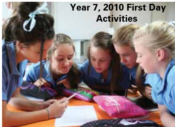
Year 7, 2010 First Day Activities