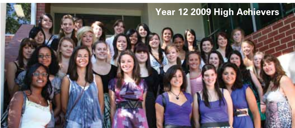
Year 12 2009 High Achievers